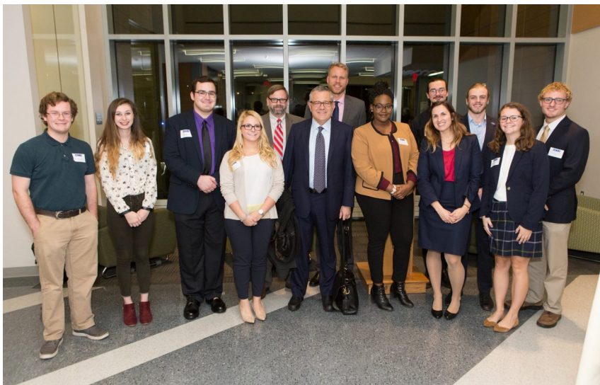
Department students and faculty with author and CNN Chief Legal Correspondent Jeffrey Toobin before his Fall 2017 Michael S. and Kitty Dukakis Public Policy Lecture.